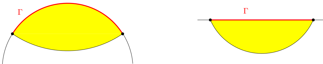
FIGURE 3. The shaded region is where we can recover the speed if the speed increases with depth, illustrating Lemma 2 (a) and (b), respectively.

Lemma 2(b) then follows from Lemma 3 since the Euclidean hypersurfaces are convex by our definition (they are flat). Using the fact that the Euclidean spheres are strictly convex, we can derive strict convexity in Lemma 2(a) under the weaker condition \partial_r c < 0 . One can check directly the the Euclidean spheres are flat for the metric |x|^{-2}dx^2 , which implies Lemma 2(a) in its full strength.