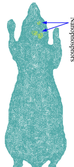
Fig. 2 Mouse model and a nanophosphor distribution in the brain.

where Q is the vector of the photon fluence rates from a series of double-cone x-ray excitations, and \mathbf{G} is a weighting matrix from Eq. (3). The NIR light yield \eta of the nanophosphors was