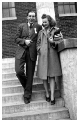
At Taylor University