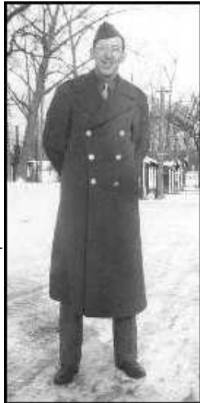
On leave before OCS January, 1943

I especially liked artillery practice. Directing the guns (that's what artillery pieces are called) when they were sometimes behind you; sometimes off to one side or the other presented interesting geometrical problems. Later, when I was in a combat unit, we built "smoke tables" on which ar-