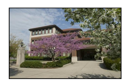
Office Hours Monday-Friday 8:00 am—12:00 pm