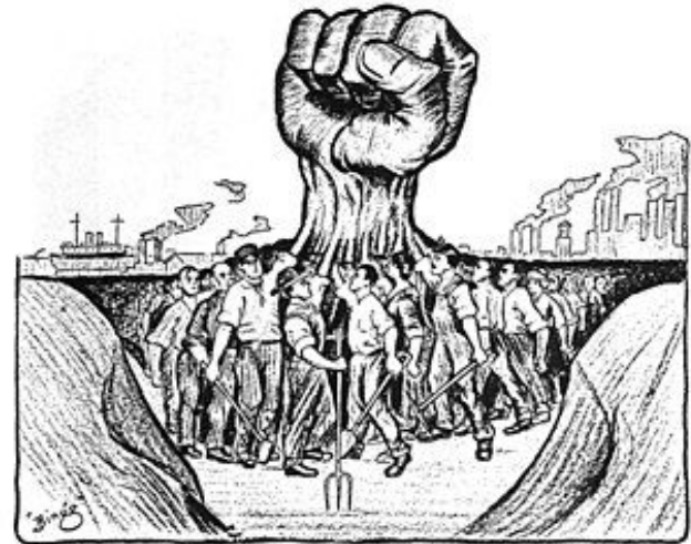
Solidarity, June 30, 1917. The Hand That Will Rule the World—One Big Union.